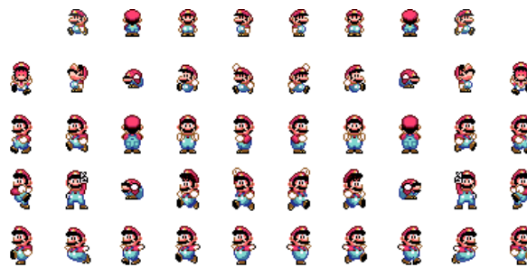
Mario sprites sheet

The programming of this first level of the Super Mario Bros game must be a little different from the original. Level 1-1 must remain the same, moreover the map of the level is available in the image file format world 1-1.png , available in the compressed file of the project resources, or in the web page of the project statement. The student must imperatively use this image. There is also another image included in the compressed file of the project resources named mario.png and the web page. It represents what are called sprites sheet, or the succession of different images necessary for the movement of the main character Mario. These sprites are also mandatory to use in the project. Although, only a few sprites are necessary for Mario's movement, you do not need to use them all. You can see below a portion of what the spites sheet looks like.